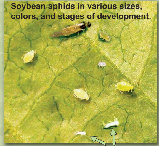
Soybean aphids in various sizes, colors, and stages of development.

Begin field scouting in late June (late vegetative to beginning bloom soybean growth stages), making one or two visits/field/week. Continue scouting until aphid populations decline, usually mid to late August.