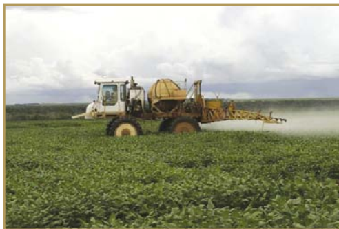
A sprayer applies fungicide to a soybean field in Mato Grosso, Brazil.