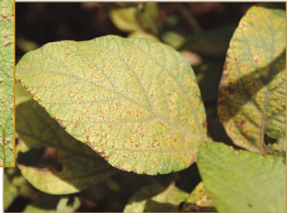
A soybean leaf heavily infected with Asian soybean rust.