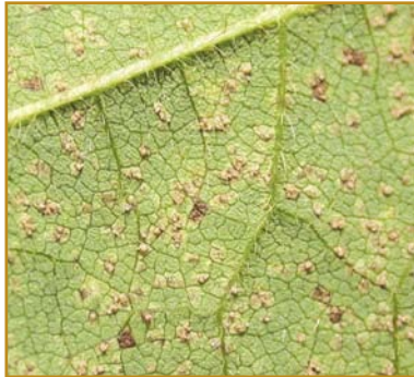
Asian soybean rust pustules on the underside of a leaf.