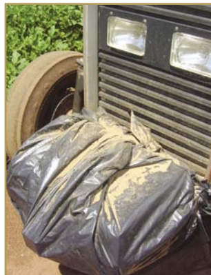
Soybean rust spores collect like dust over plastic bags covering the front weights of a tractor in Mato Grosso, Brazil.

Spores may survive on their own for about 40 days, but it is unlikely that spores on residue would survive an Indiana winter. Like other rust fungi, soybean rust requires a living host to grow and reproduce. To the best of our knowledge, soybean rust will only survive North American winters in southern regions where host plants retain green foliage. It can infect many other legume species, most of which are tropical or subtropical; many occur in Florida, but some occur in the Midwest. Among these are yellow sweetclover ( Melilotus officinalis ), butter and lima bean ( Phaseolus lunatus ), kidney and green bean ( Phaseolus vulgaris ), crown-vetch ( Coronilla varia ), and kudzu ( Pueraria lobata ). Kudzu and other perennial legume hosts in the South will probably be important for soybean rust's winter survival. The actual area where the fungus will survive in North America remains to be seen, but best current estimates include southern Florida and Texas, Mexico, and the Caribbean islands.