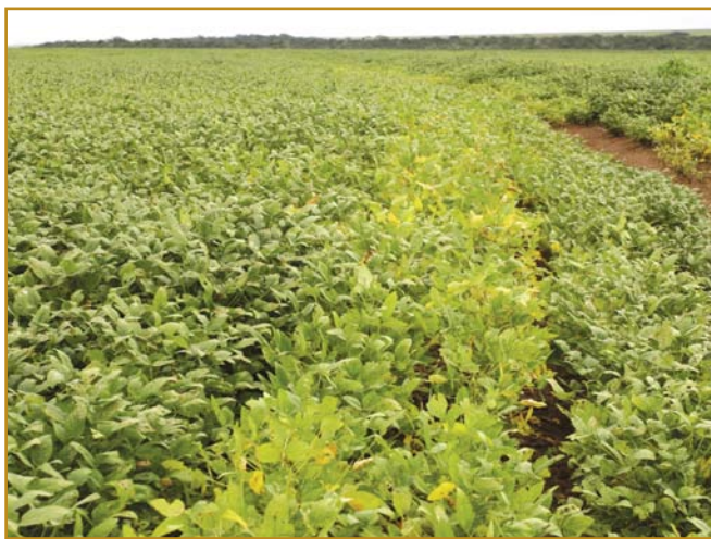
The yellow areas in this field show areas of fungicide sprayer skips, resulting in soybean rust infection.

For the most effective control, experience with soybean rust in Brazil suggests that droplets should be fine- to medium-sized (a volume median diameter of about 200 \mu\text{m} ). Of course, such tiny droplets have a greater potential to drift than large droplets (the size commonly used for herbicides). Fungicide drift may not cause obvious symptoms in nontarget plantings (unlike herbicide