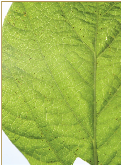
Backlighting reveals soybean rust lesions on the top of a leaf.

This site includes state-by-state listings for all fungicides receiving emergency use (or Section 18) exemptions from the EPA.