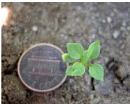
Fig. 7. Common chickweed is a weak alternative host to SCN.