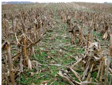
Fig. 1. Winter annual weeds have become more common in crop fields due to reduced reliance on tillage and soil-applied herbicides.

Winter annual weed populations in production fields (Fig. 1) have been increasing due to the widespread adoption of conservation tillage practices and reduced reliance on herbicides with soil residual activity (37). A number of common winter annual weed species have recently been identified as alternative hosts for soybean cyst nematode (52). SCN has long been known as a threat to profitable soybean production throughout soybean growing regions of the United States. Current management systems for SCN include rotation to a non-host crop and use of SCN resistant soybean varieties but fail to address winter annual weed management. Failure to manage winter annual weeds may provide a niche for SCN reproduction and increase population density in the absence of soybean. The purpose of this review article is to summarize the current literature about the management implications of SCN and winter annual weed management.