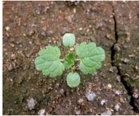
Fig. 4. Henbit is a strong alternative host to SCN.