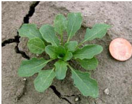
Fig. 5. Field pennycress is a moderate alternative host to SCN.