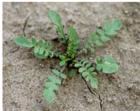
Fig. 8. Smallflowered bittercress is a weak alternative host to SCN.