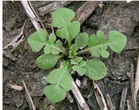
Fig. 6. Shepherd's-purse is a weak alternative host to SCN.