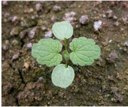
Fig. 3. Purple deadnettle is a strong alternative host to SCN.

greenhouse experiment in Ohio, purple deadnettle ( Lamium purpureum L.) (Fig. 3), henbit ( Lamium amplexicaule L.) (Fig. 4), field pennycress ( Thlaspi arvense L.) (Fig. 5), and shepherd's-purse [ Capsella bursa-pastoris (L.) Medik] (Fig. 6) were shown to support SCN reproduction (52). Earlier reports had identified common chickweed [ Stellaria media (L.) Vill.] (Fig. 7) and smallflowered bittercress ( Cardamine parviflora L.) (Fig. 8) as hosts to SCN (41). In addition, Creech et al. (12,17) has shown that SCN can reproduce on purple deadnettle and henbit in the field after soybean harvest in the fall in Indiana.