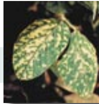
Figure 2: Soybean leaves showing symptoms of sudden death syndrome.